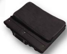
Available in Black & Olive