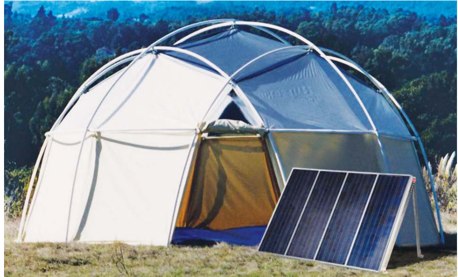
ABOVE: The 200W solar array deployed outside a Shelter Systems emergency dome-shelter. BELOW: Shows the typical “inside-the-dome-shelter” setup for powering a wide range of devices.