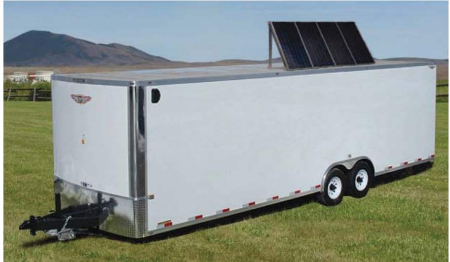
ABOVE: The 200W solar array deployed on top of a trailer.